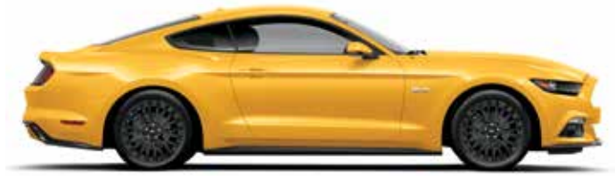
Triple Yellow Tri-coat