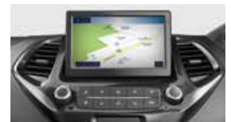
Touchscreen With Embedded Navigation